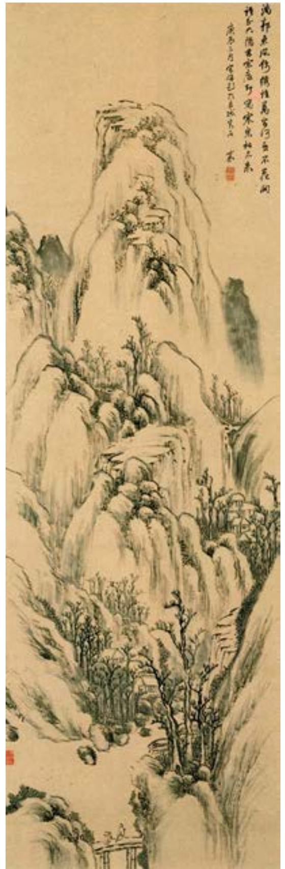
Wintry Trees ;hanging scroll, ink on paper 寒岩枯木図 紙本着色 Edo period,1820 江戸時代後期 SEIKADO BUNKO ART MUSEUM 静嘉堂文庫美術館 Rai San'yo(1780 - 1832) 頼山陽

The DH project was integrated in undergraduate and graduate teaching.